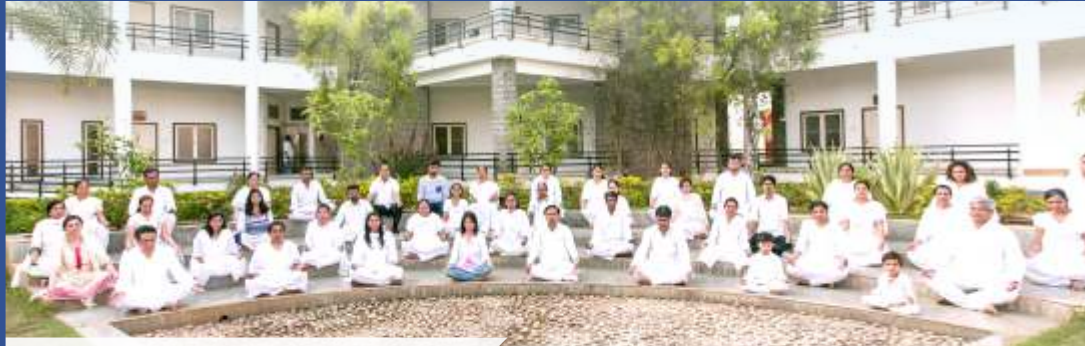
RESEARCH CENTRE AT RAJ NAGAR, PARLI

All humanitarian activities are guided by the 'Vitraag Vigyaan' philosophy – the eternally complete scientific path to experience peace, compassion and bliss.