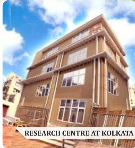
RESEARCH CENTRE AT KOLKATA

'Essence of Life' lessons : Empowerment retreats on subjects such as 'The Power of Inspiration', 'The Power of Right Understanding', 'Achieving your goal through the power of concentration', 'Art of Relationship Management', 'The principles of Karma' and likewise topics conducted by senior sadhaks brings together people from all walks of life with the common objective to enlighten the Self and the Society.